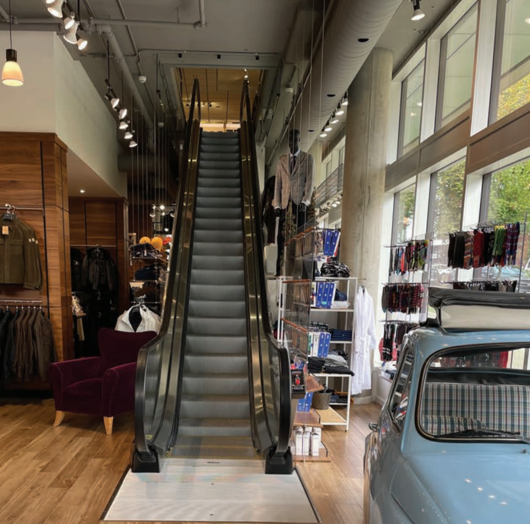
📷 Main entrance and escalator to second floor