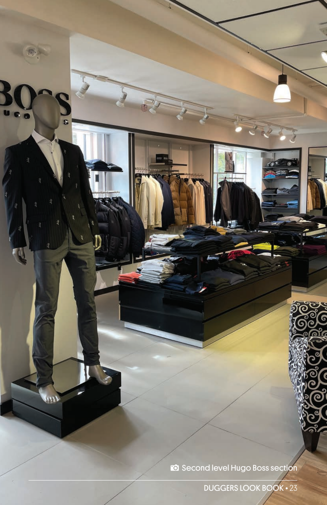
📷 Second level Hugo Boss section