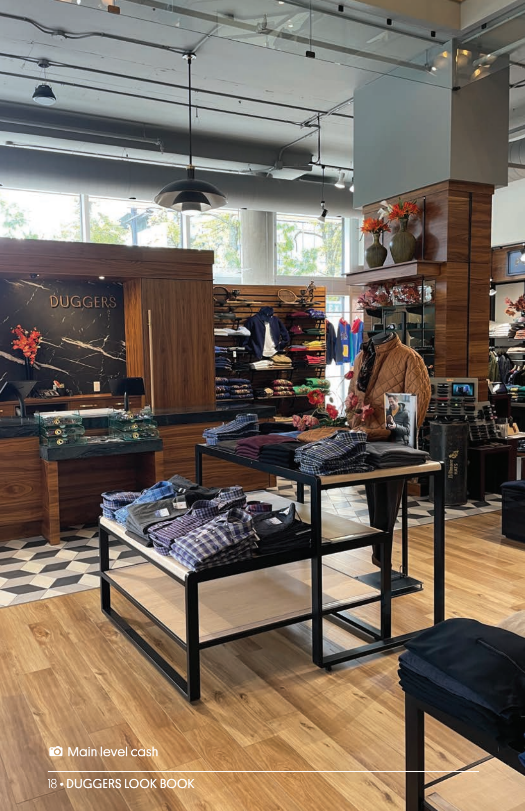
📷 Main level cash