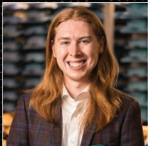
Terry Shipping & Receiving